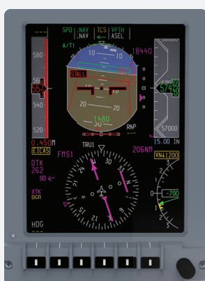
DU-875 NG LIGHT